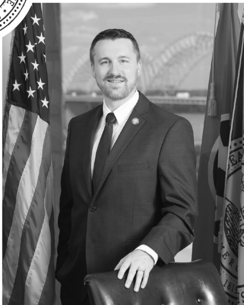
Shelby County Commissioner Mick Wright